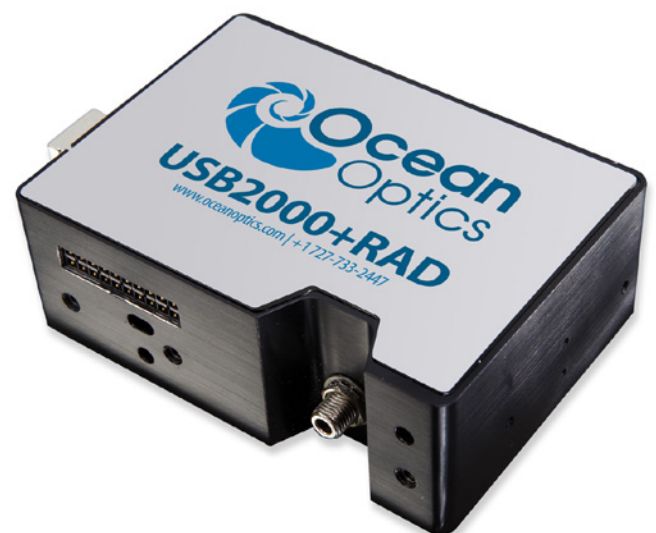
Figure 2. Small-footprint miniature spectrometers are ideal for monitoring LEDs and other sources in lab and production environments.

Color resolution is another consideration. Most handheld color meters deliver less than 20 wavelength bands, not enough for accurate or scientific studies. So what if you want to make a high-resolution color measurement, but can't tolerate the size