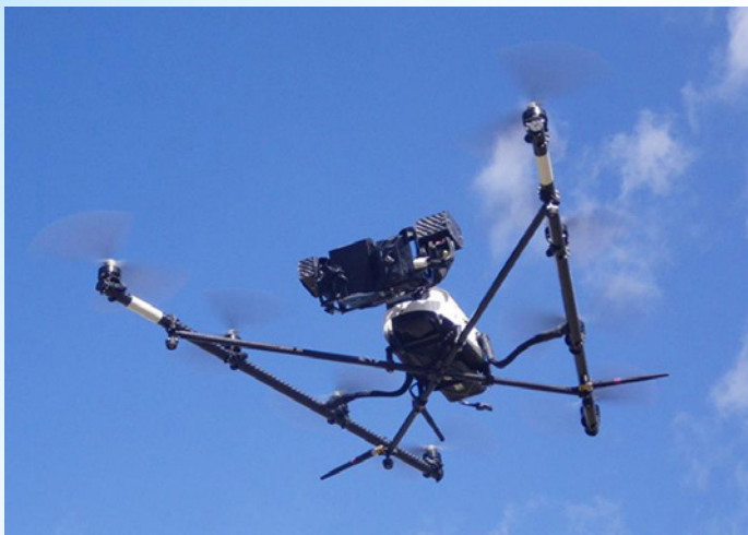
Figure 1: Air-based spectral measurements can be performed very effectively across vast areas and at altitudes up to 200 meters.

a little over 2 ounces (68 g) -- overcomes those limitations, accelerating measurement sessions by up to 20x compared with ground-based spectroscopy.