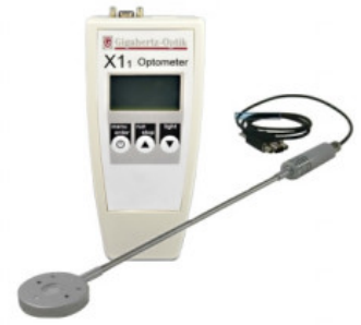
UV Curing Radiometer with a separate RCH-116-4 detector for measurement of high-power LED lamps in UV-A and blue light radiation curing

One essential quality feature of photometric devices is their precise and traceable calibration. The RCH-116-4 detector is calibrated for standard Curing LED wavelengths: 365 nm, 375 nm, 385 nm, 395 nm, 405 nm, and 430 nm . The calibration is performed by Gigahertz-Optik's ISO 17025 calibration and testing laboratory allows highest accuracy since is