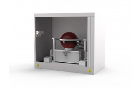
TPI-21-TH for measurement of the luminous flux, spectrum, color, and color rendering index without dark box

The LEDA-7-TEC LED test socket of the TPI21-TH LED measurement system has 250 W Peltier element with a powerful heat exchanger for rapid regulation of the LEDs' junction temperature. This makes it possible to also operate large PCBs (up to 70 mm diameter) in the entire temperature range between +25°C to +85°C +/-1°K. A PT100 temperature sensor is integrated in the heat sink. LED adapters are additionally offered for both standard SMD LEDs and onboard LEDs. All the LED adapters support separate current supply and voltage measurement of the test LED via four-pole contacts. The attachment to the heat sink is done