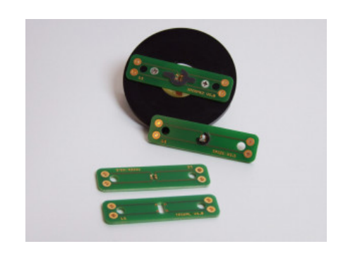
TPI21-TH, LED mounting adapters