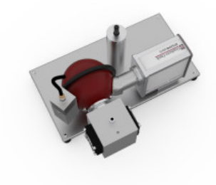
TFUV10-V01 during the measurement of BN-LDSF-2P.

Further studies have also shown that barium sulfate coatings fluoresce less than synthetic coatings. In addition, the reduction in fluorescence in case of barium sulfate coatings has a longer lasting effect (see <u>technical article</u>). For this reason, contrary to the previous guidelines, barium sulfate is recommended as a coating material for short wavelength UV measurement applications when lowest fluorescence is needed. Due to the particularly low dose of binders in Gigahertz-Optik's ODP97 barium sulfate coating, the topic of long-term stability under permanent UV irradiation is not so critical since barium sulfate itself is UV-stable. However, synthetic coatings still show more stable spectral reflective properties under deep