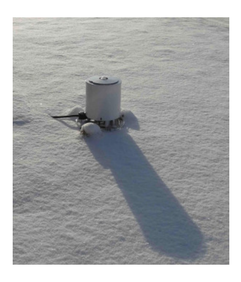
The WP version in a winter measurement campaign