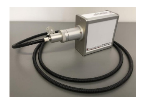
CP-CD-90-10: 90° Irradiance Optics with Fiber

One essential quality feature of photometric devices is their precise and traceable calibration. The BTS2048-VL-TEC-F is calibrated by Gigahertz-Optik's calibration laboratory that was accredited by DAkkS (D-K-15047-01-00) for the spectral responsivity and spectral irradiance according to ISO/IEC 17025. The calibration also included the corresponding accessory components. Every device is delivered with its respective calibration certificate.