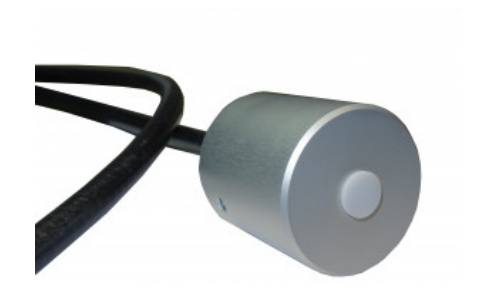
CP-CD-IL-10: Inline 37 mm Detector Head