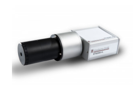
The BTS2048-VL-CP-ILED-B-IS-1.0-HL luminous intensity spectroradiometer to measure Averaged LED intensity (CIE127 B) is a compact module that can be integrated in LED test systems.

In an attempt to bring some conformity to the data presented in LED manufacturers' literature, the CIE introduced the new term 'Averaged LED Intensity' For this purpose CIE 127 defines measurement distance and the area over which it is to be performed. The commonly used 'Condition-B' specifies a measurement distance of 100mm and a sensor area of 100 mm² which must have extremely high uniformity over its entire area. The BTS2048-VL with the CP-ILED-B-IS-1.0-HL input lens is ideal for measurement of the "averaged LED intensity I<sub>LED-B</sub>".